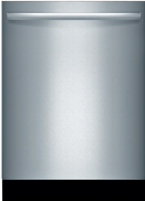
SGX68U55UC Stainless Steel

The 3rd rack offers 30% more loading area. Perfect for ramekins, cooking utensils and extra long silverware.