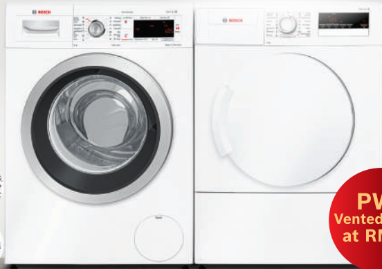
WTA74201SG 7kg Vented Dryer • AutoDry • Sensitive Drying System (RRP: RM2,999)