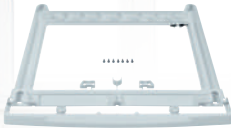
WTZ11311 Stacking kit for 7kg Vented Dryer WTA74201SG (RRP: RM309)