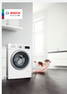
Washing Machine Range.