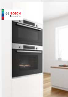
Oven and Compact Range.