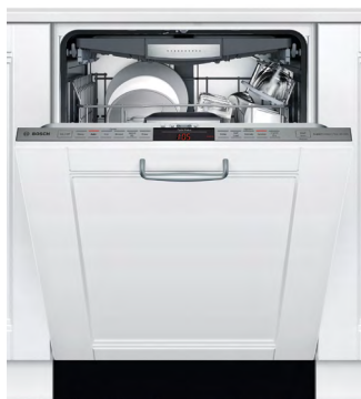
SHVM78Z53N Custom Panel

Patented CrystalDry™ technology transforms moisture into heat to get dishes, including plastics, 60% drier. 1