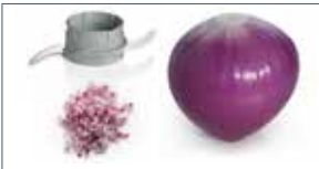
Supercut multifunctional knife