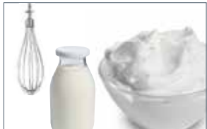
Stainless steel balloon whisk