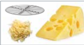
Reversible grater (coarse)