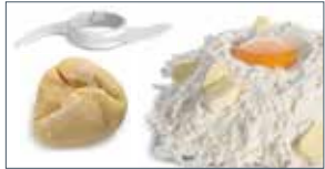
Plastic dough tool