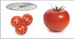
Reversible slicer (coarse)