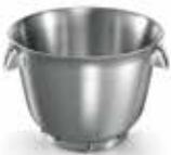
Stainless steel bowl