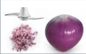
Universal chopping blade