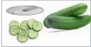
Reversible slicer (fine)