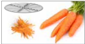
Reversible grater (fine)