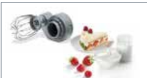
Stainless steel whisk

* Accessories can be purchased from Bosch Customer Service Center.