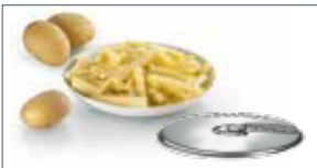
French fries disc