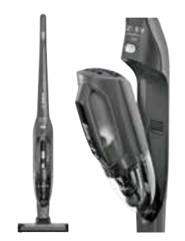
Readyy'y BBHI 2214AU