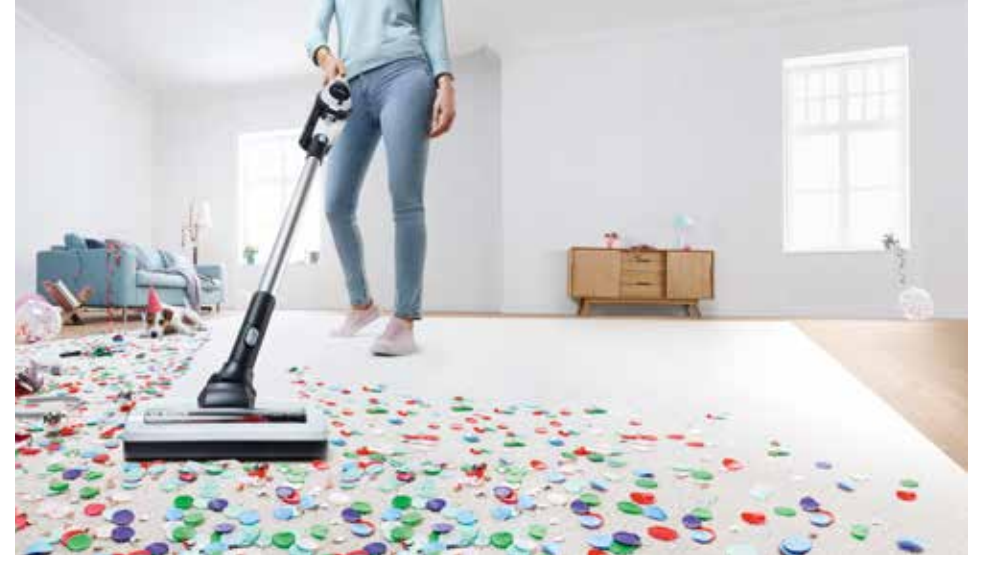
The AllFloor HighPower brush and DigitalSpin brushless motor ensure intensive cleaning performance.