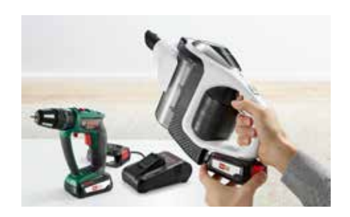
The battery pack Power for ALL System is part of the 18-Volt cordless system from Bosch Green Home & Garden.

The dust box is easy to remove and empty without coming into any contact with dust thanks to the RotationClean filter system.