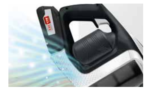
Thanks to the Cartridge Filter with Hygienic Filter, the exhaust air is cleaner than the room air.