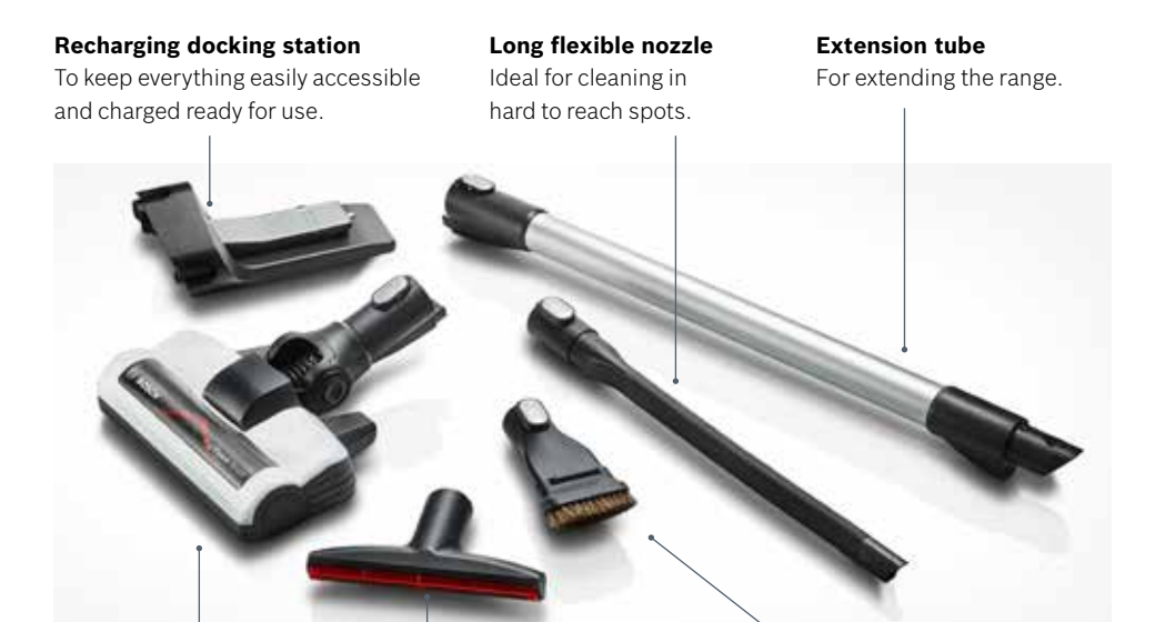
AllFloor HighPower brush Suitable for all kinds of floors.

Thanks to multiple accessories, you can clean up all around your home – and even in your car.