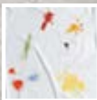
Degree of soiling