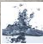
Degree of water hardness

On this basis, the amount of detergent is dosed optimally and down to the nearest millilitre.