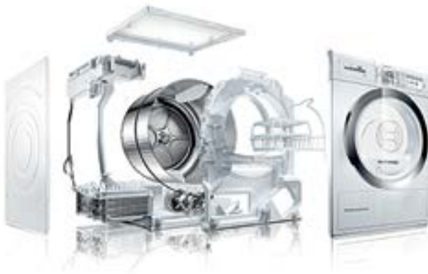
The Bosch dryer range includes heat pump with ActiveAir technology, condenser and vented dryers.