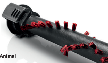
ProAnimal brush roller, optimised for carpets.

Zoo'o ProAnimal roller – picks up pet hair 30% faster. Specialised soft red bristles have been optimised for carpets to remove animal hairs quickly and efficiently.