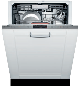
SHV88PW53N Custom Panel

The MyWay™ easily fits larger & deeper items like cereal bowls, freeing up extra space for pots & pans in the bottom rack.