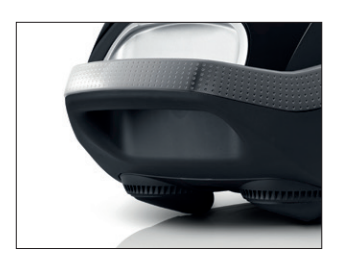
Four soft wheels

The dust bag of the In'Genius has an extra large capacity, which means it doesn't have to be changed very often.