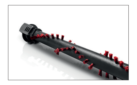
Zoo'o ProAnimal roller

The Zoo'o ProAnimal range effortlessly picks up animal hair on all types of flooring and with handy accessories lets you tackle pet hair on furniture and in crevices as well. Available in cordless, bagless and bagged.