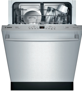
SHX4AT55UC Stainless Steel

Bosch dishwashers are so quiet, you may forget they're on. InfoLight® projects a red light onto the floor to let you know it's on.