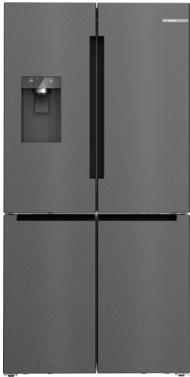
Series 6 | Bottom Freezer, Multi Door