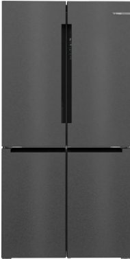
Series 6 | French Door Bottom Freezer, Multi Door