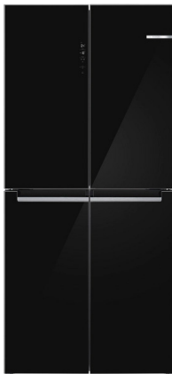
Series 4 | French Door Bottom Mount