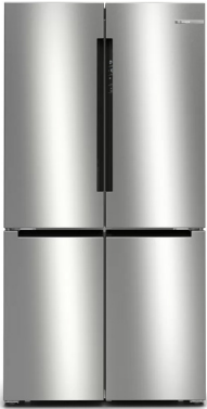
Series 6 | French Door Bottom Freezer, Multi Door