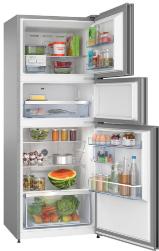
Series 4 | Free-standing fridge-freezer with freezer at top