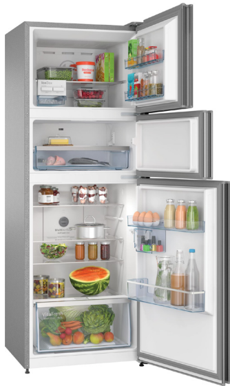
Series 4 | Free-standing fridge-freezer with freezer at top