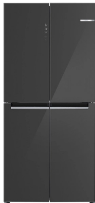
Series 4 | French Door Bottom Mount