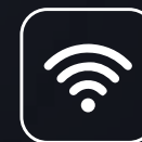
Connected Via Wifi