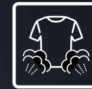
Iron Steam Assist