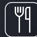
Additional Cutlery Drawer