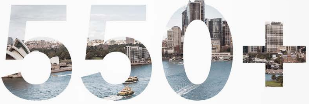
design awards won since 2007