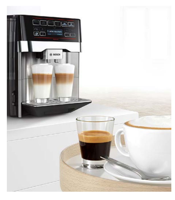
/ MORNINGS MADE EASY - coffee makers, toasters and kettles