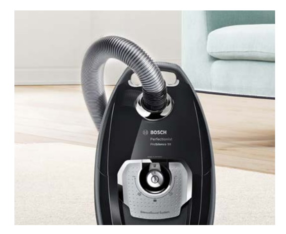
EXPERT CARE AND CLEANING washers and dryers, vacuum cleaners and steam irons