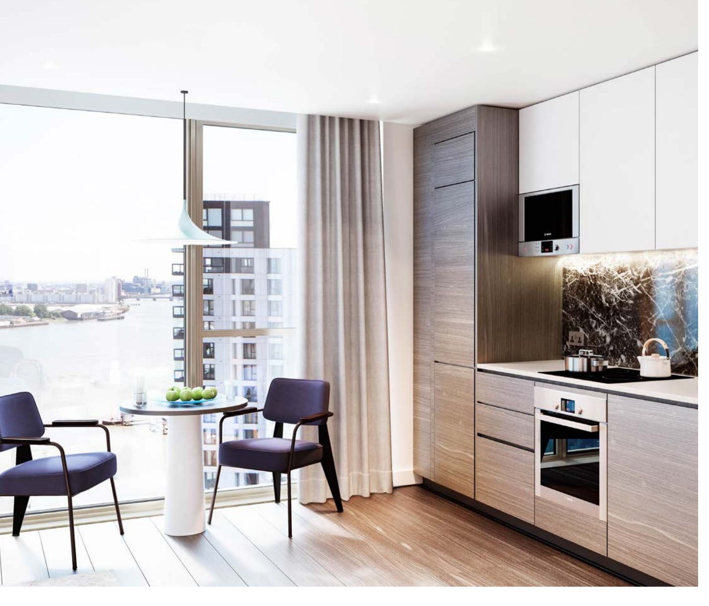
BOSCH DESIGN in London's newest cultural hub

The Peninsula is modern, cutting-edge and full of delightful details – so Bosch appliances are a perfect fit. From the sleek Series 8 oven with green technology to the exceptionally quiet washer-dryer, ease of use is assured. This way, Peninsula residents have more time to enjoy their new surroundings, and each other.