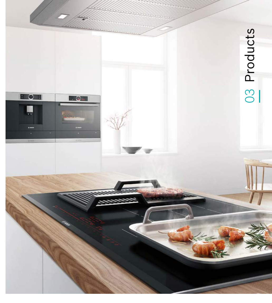
MASTER EVERY MEAL – ovens, cooktops, microwaves and accessories