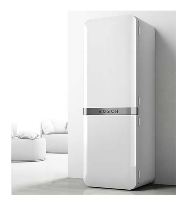
THE EASY WAY TO STAY COOL - refrigerators and freezers

Our appliances are sophisticated, so home life can be simple. From storing fresh ingredients, to cooking and baking, to freezing any leftovers, our appliances are designed to make your routines more relaxing – and pleasing to all the senses. Barista-quality coffee for breakfast is just the start!