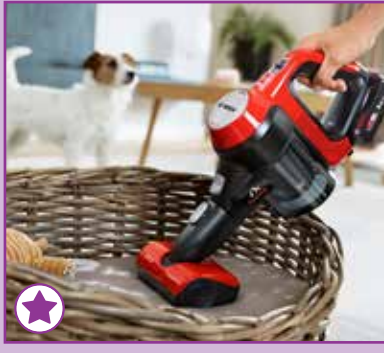
ProAnimal mini power nozzle