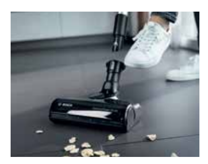
Nozzle foot release Detach the nozzle from the tube without bending over. Easily switch from floor cleaning to overhead or spot cleaning.

Comfortably clean with the handheld unit while the nozzle and tube stand by themselves.