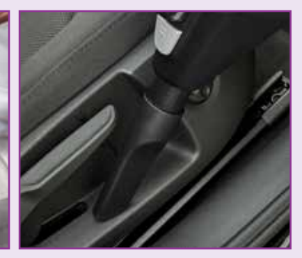
Short crevice tool