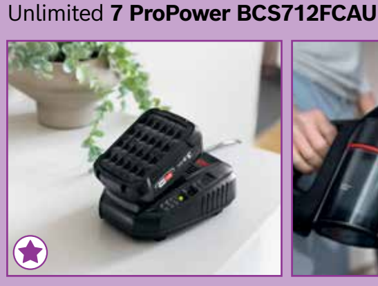
Quick charger & 2nd battery for extendable runtime