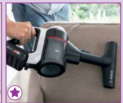
XXL upholstery nozzle with 360° rotation