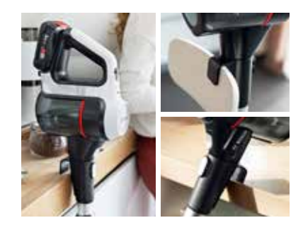
Easy parking clip Securely park the vacuum at the edge of a chair, table or benchtop when taking a break.