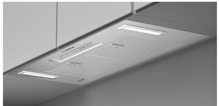
Installed in frameless cabinets

Accessories: To purchase Bosch accessories, cleaners & parts please visit www.bosch-home.com/us/store or call 1-800-944-2904 (Mon to Fri 5 am to 6 pm PST, Sat 6 am to 3 pm PST).