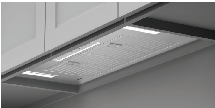
Installed in framed cabinets