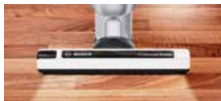
Dust pick-up on hard floors