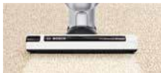
Dust pick-up on carpet

The motorised AllFloor HighPower brush achieves thorough cleaning results on all floor types, such as parquet, carpet and tiles. The vacuum also has a turbo power mode for particularly stubborn areas, like thick pile carpets.