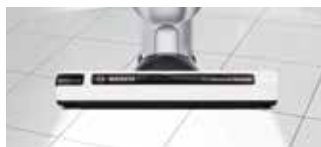
Dust pick-up in cracks and crevices