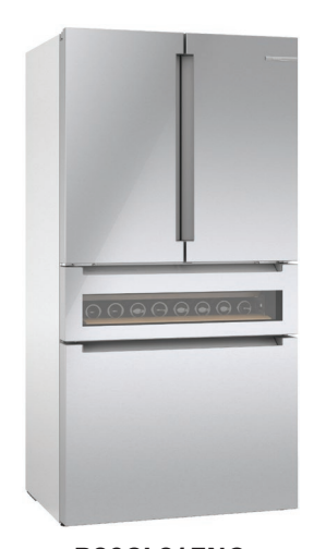
B36CL81ENG Glass over Stainless St

Glass over Stainless Steel w/ Recessed Handles