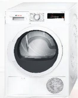
8Kg Condenser Dryer WTB86201SG

Water Consumption: 6.20 litres/kg Registration No: WM-2018/024265/TUV