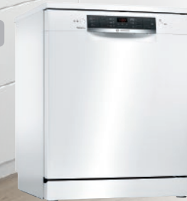
60cm Freestanding Dishwasher SMS46GW01P