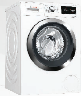
10Kg ProSilence Washer WAU28440SG

Purchase Side by Side Fridge KAN92VI35O and get ONE of these appliances at only $999.