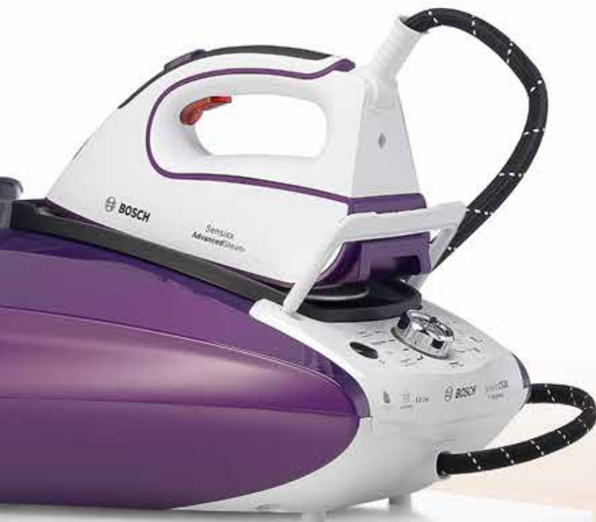
Model shown is TDS3880GB

Welcome to our fast, easy and hygienic irons. Ergonomic in design and packed with labour saving features for effortless ironing.