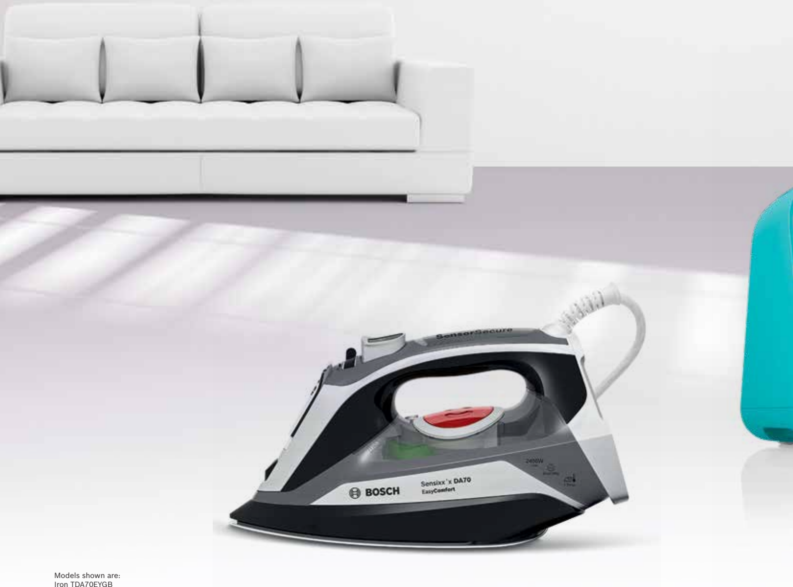
Models shown are: Iron TDA70EYGB Food processor MUM54S00GB Cordless vacuum cleaner BCH65TRPGB

As you would expect from Bosch, they are packed with innovative technology and deliver the same levels of performance, build quality and reliability as our large appliances.